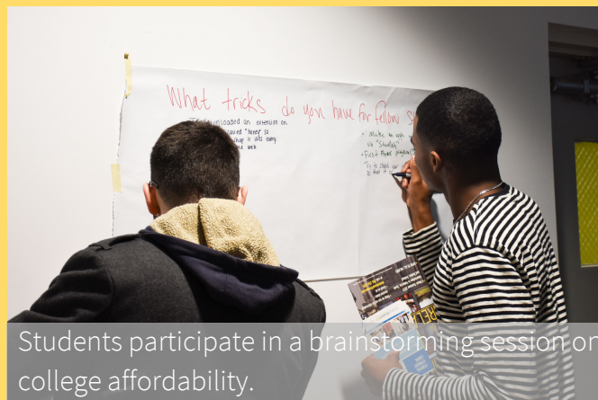
Students participate in a brainstorming session on college affordability.