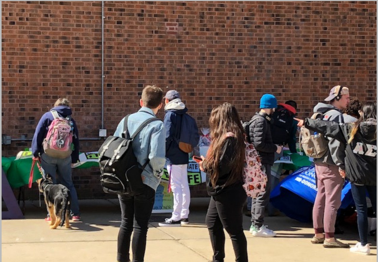
Students meet with vendors at the 2018 resource fair