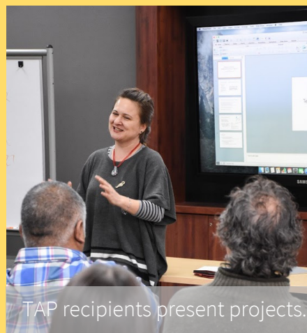
TAP recipients present projects.