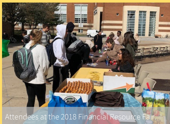
Attendees at the 2018 Financial Resource Fair.