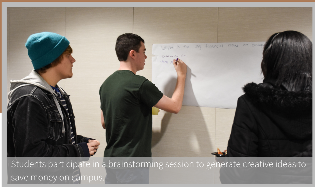
Students participate in a brainstorming session to generate creative ideas to save money on campus.

The mission of the Affordability Task Force is to better understand the financial-related needs of our students. We are dedicated to implementing strategies to ensure our students are aware of existing campus resources and strive to develop ideas for additional services deemed necessary for an affordable education here at Rowan University.