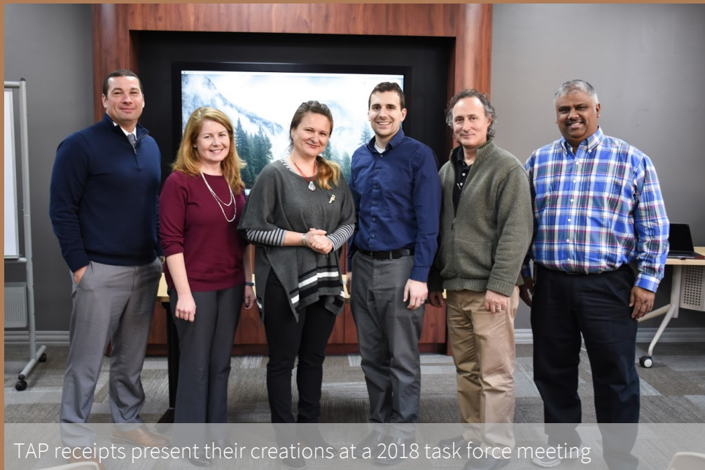
TAP receipts present their creations at a 2018 task force meeting