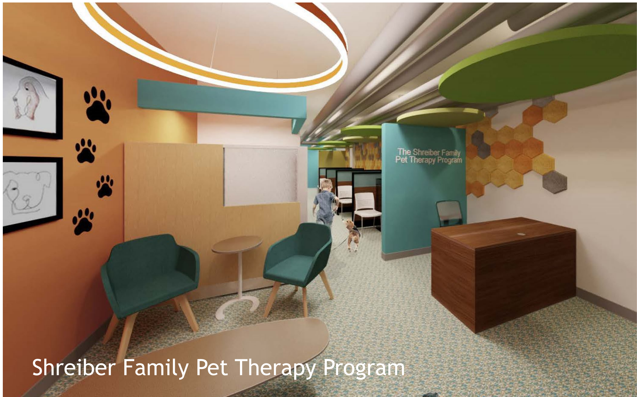
Shreiber Family Pet Therapy Program