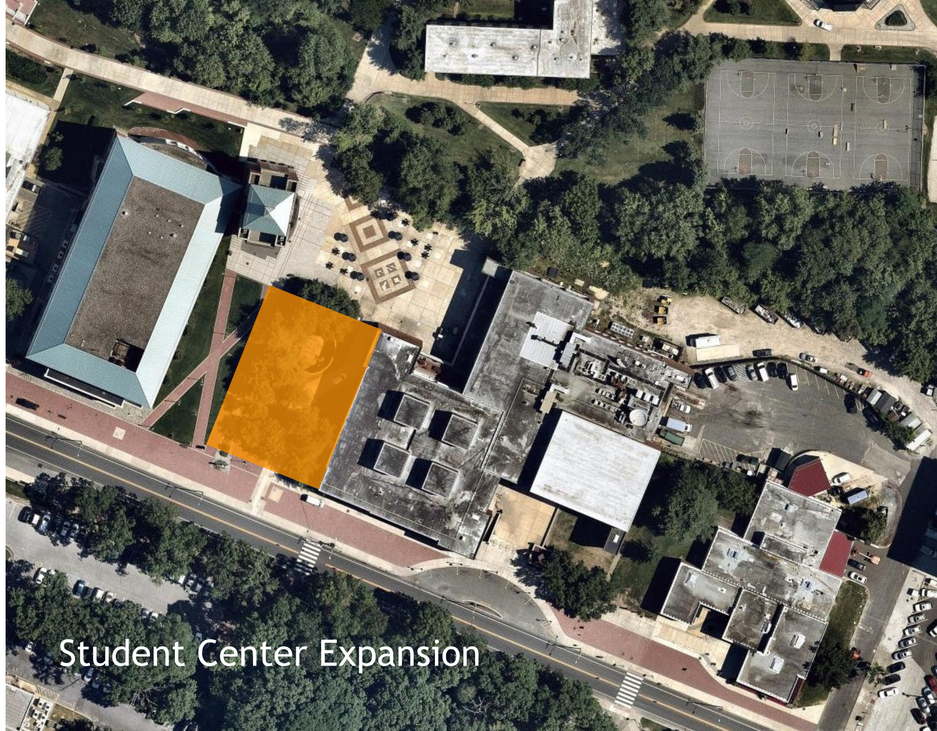
Student Center Expansion