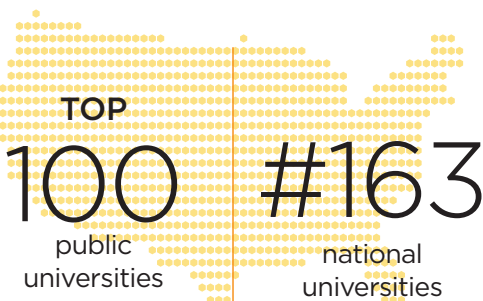
U.S. News & World Report 2023 rankings