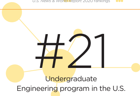
U.S. News & World Report 2020 rankings