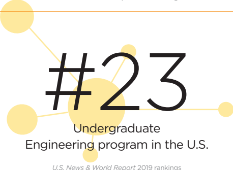
U.S. News & World Report 2019 rankings