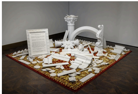
Installation view of The Architecture of Memory , 2023, Artwork by Virginia Maksymowicz.