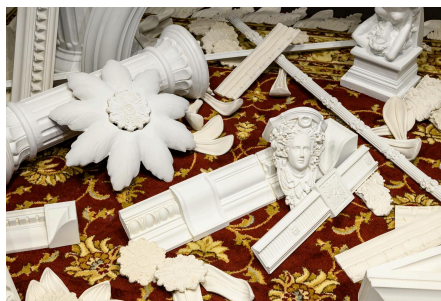
Installation detail of The Architecture of Memory , 2023, Artwork by Virginia Maksymowicz.