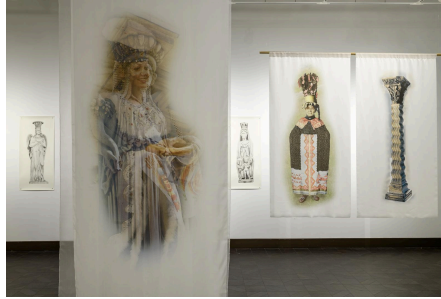
Installation view of The Lightness of Bearing , 2023, Artwork by Virginia Maksymowicz.