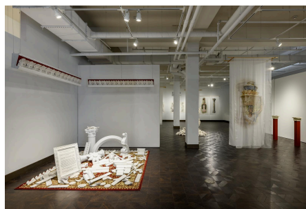
Installation view of The Lightness of Bearing , 2023, Artwork by Virginia Maksymowicz.