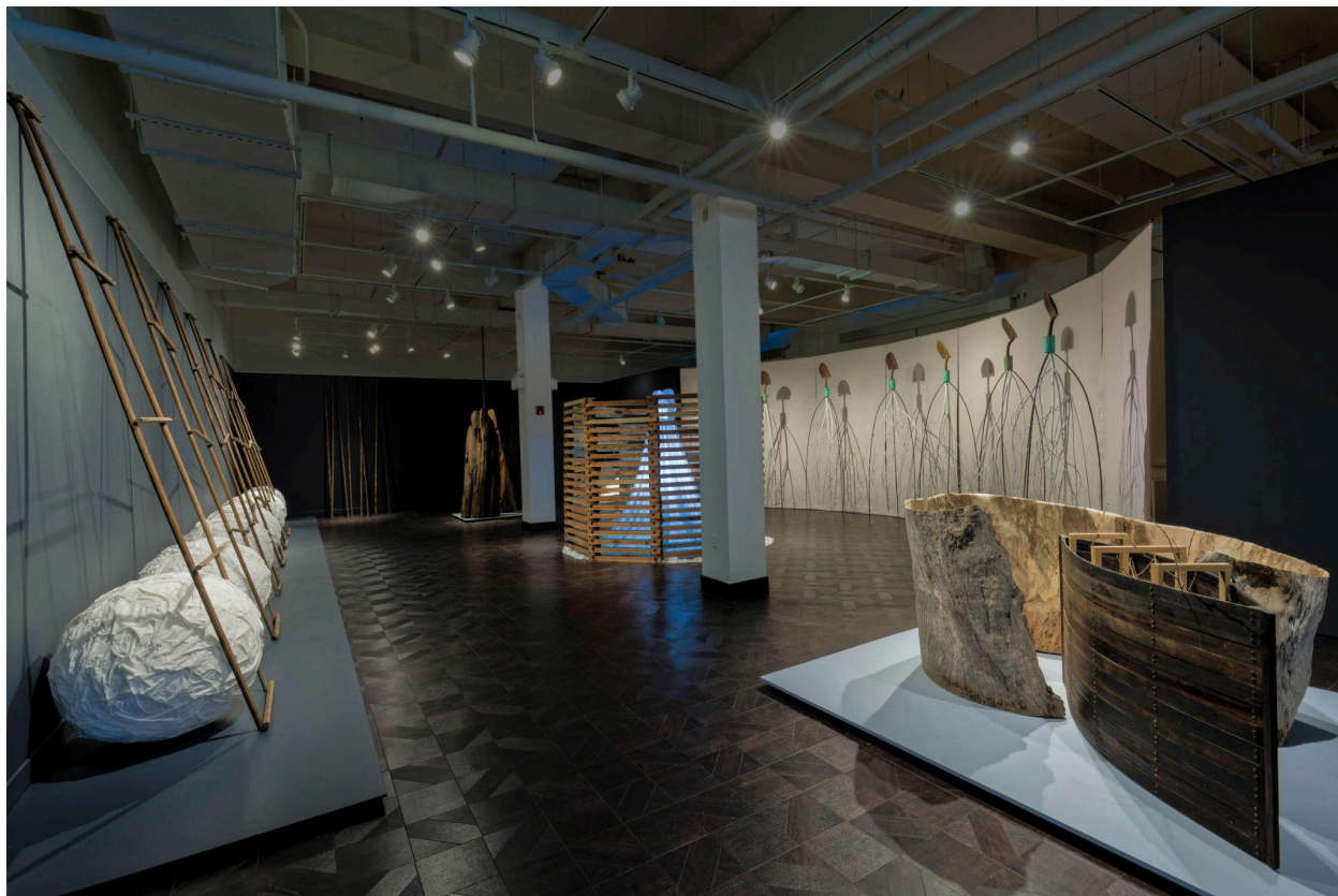
Installation view of Bonding , Jack Larimore, Rowan University Art Gallery & Museum, 2024.