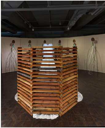
Installation view of Femina , Jack Larimore, Cedar, steel, cotton voile, lighting, 120 x 120 x 108 inches. Rowan University Art Gallery & Museum, 2024.