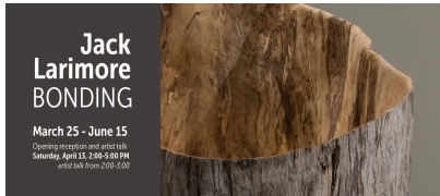
© Jack Larimore, Detail of Sycamore Story , 2021, Sycamore, cypress, pine tar, bronze, 68 x 67 x 40 inches.