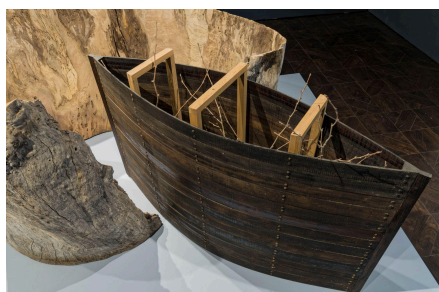
Installation view of Sycamore Story , Jack Larimore, Sycamore, cypress, pine tar, bronze, 68 x 67 x 40 inches. Rowan University Art Gallery & Museum, 2024.