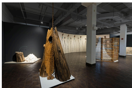
Installation view of Bonding , Jack Larimore, Rowan University Art Gallery & Museum, 2024.