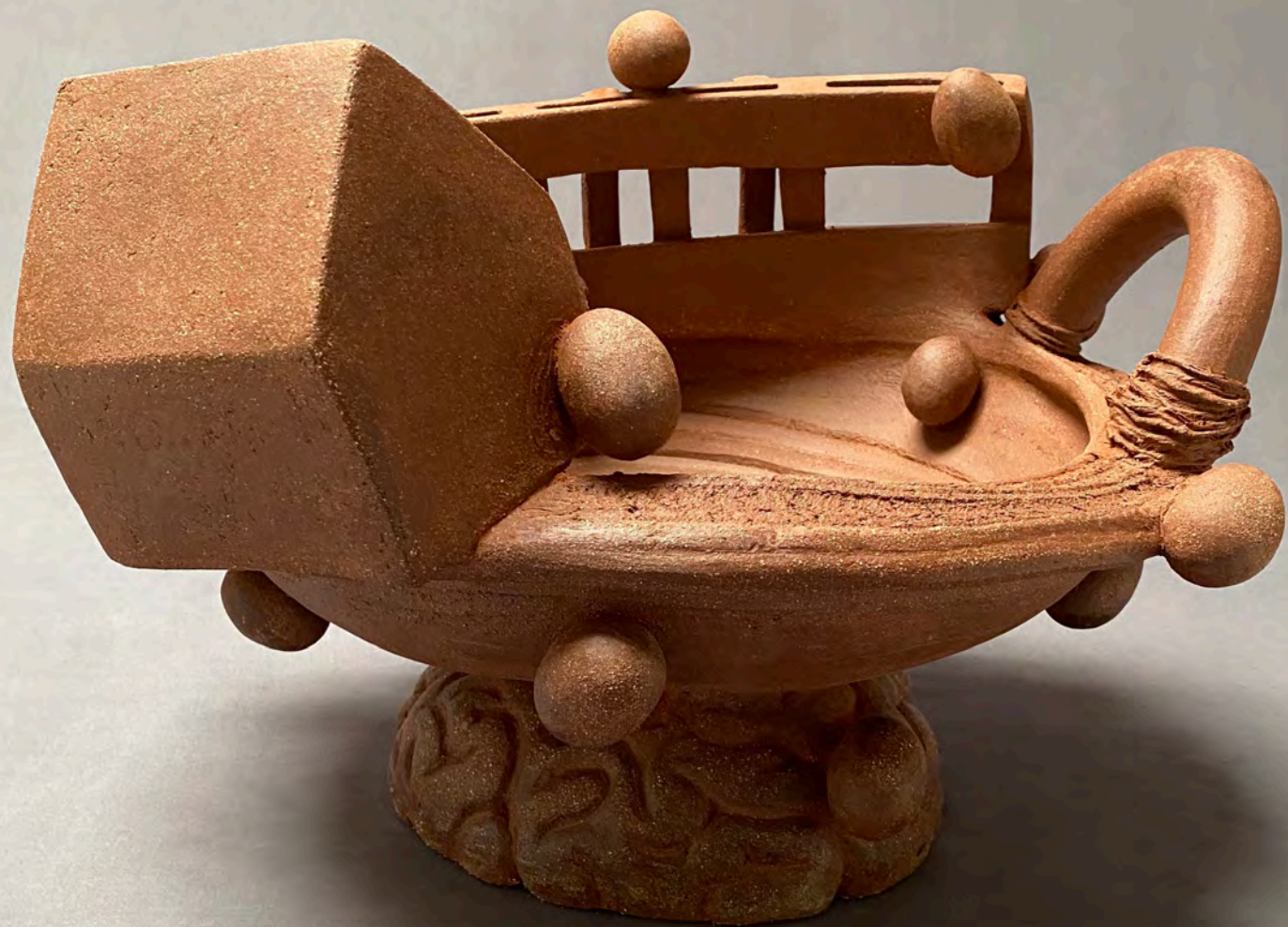
Laurie Mason, 2021 Stoneware, 14 x 22 x 20 inches