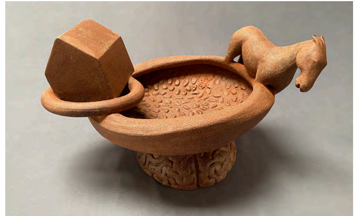
O'Neal Smalls , 2021 Stoneware, 13.5 x 23 x 17 inches