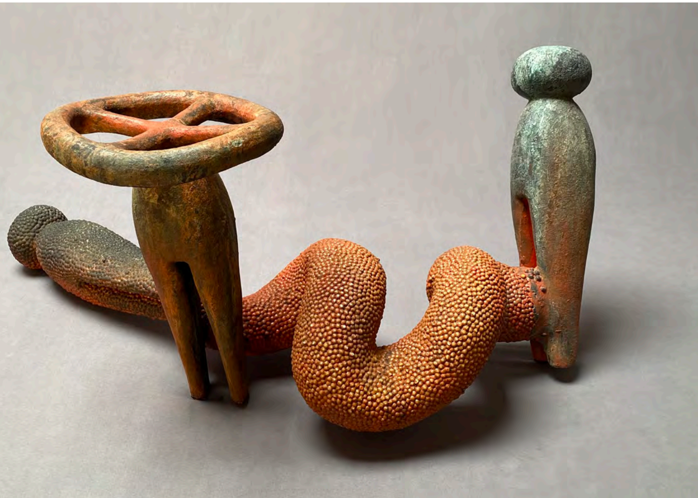
3 Mother Pins on a Vine, 2021 Clay, mixed media, 18 x 37 x 26 inches