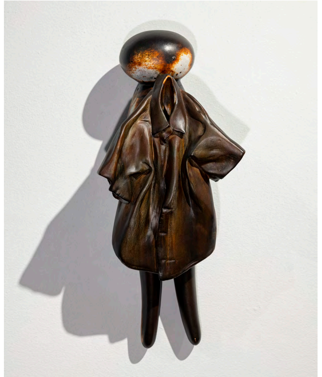
Mother Pin with Shirt Clay, graphite, 19 x 8 x 7.5 inches