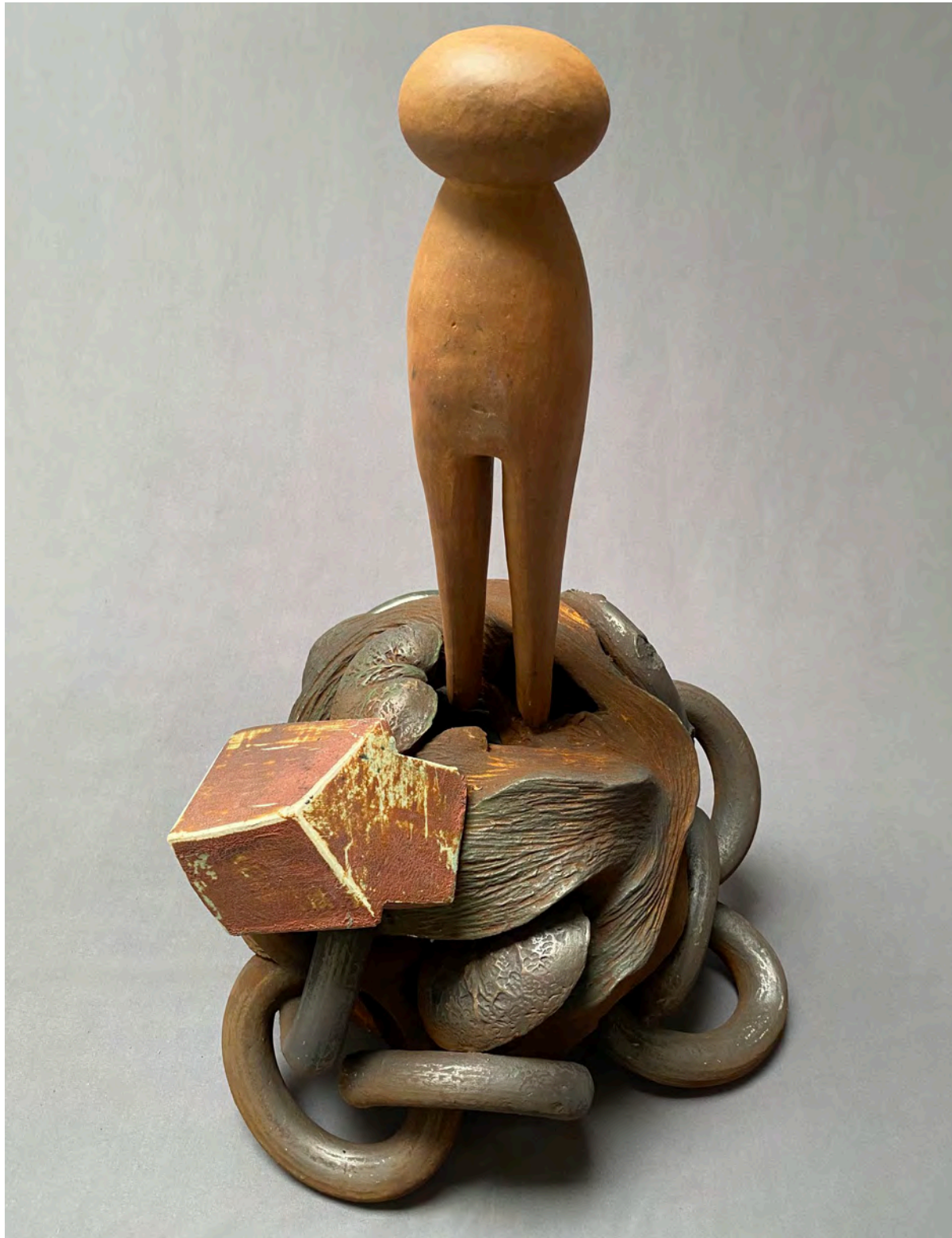
Mother Pin Arise , 2020 Clay, graphite, water color, 28 x 19 x 19 inches