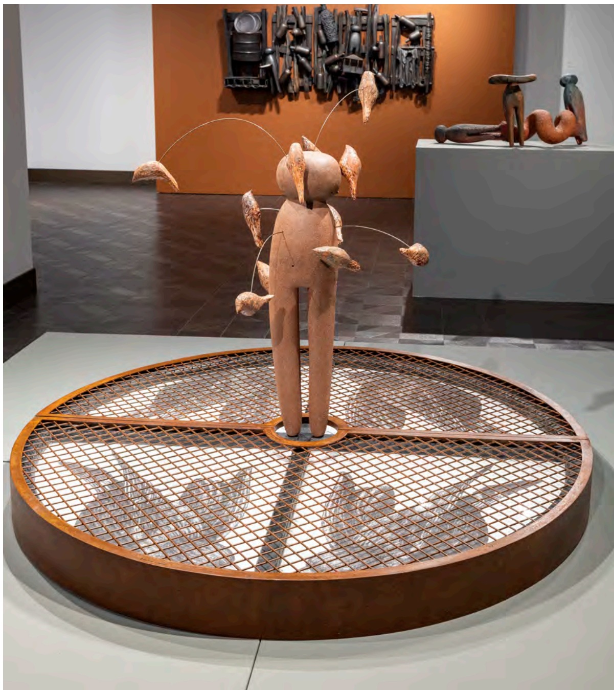
Release , 2021 Wood, digital print on paper, clay, papier-mâché, steel, acrylic with graphite, 39 inches high x 59 inches diameter