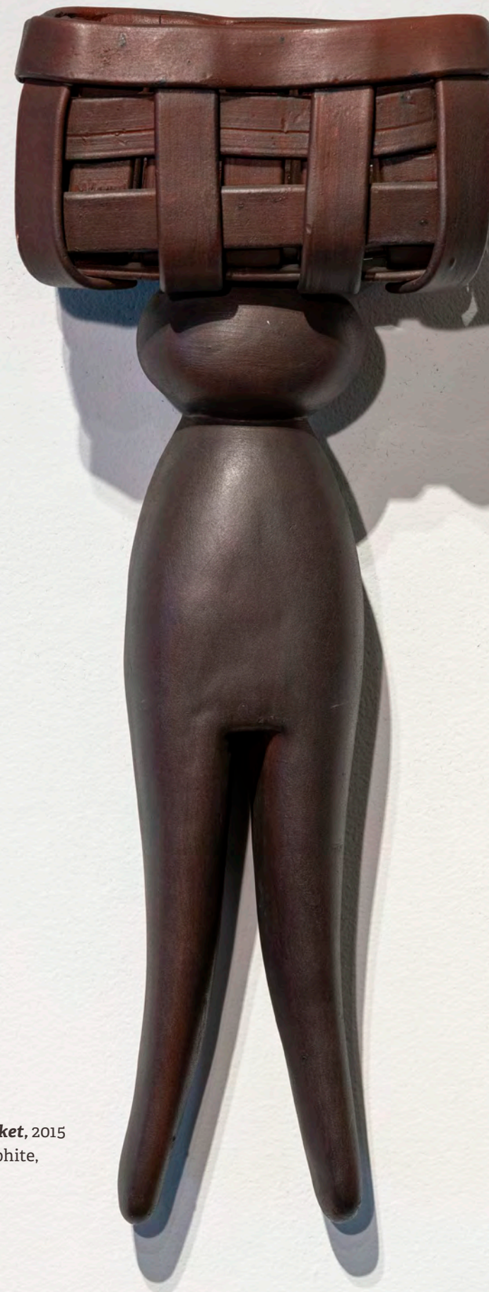
Mother Pin with Basket , 2015 Clay, watercolor, graphite, 24 x 9 x 7 inches