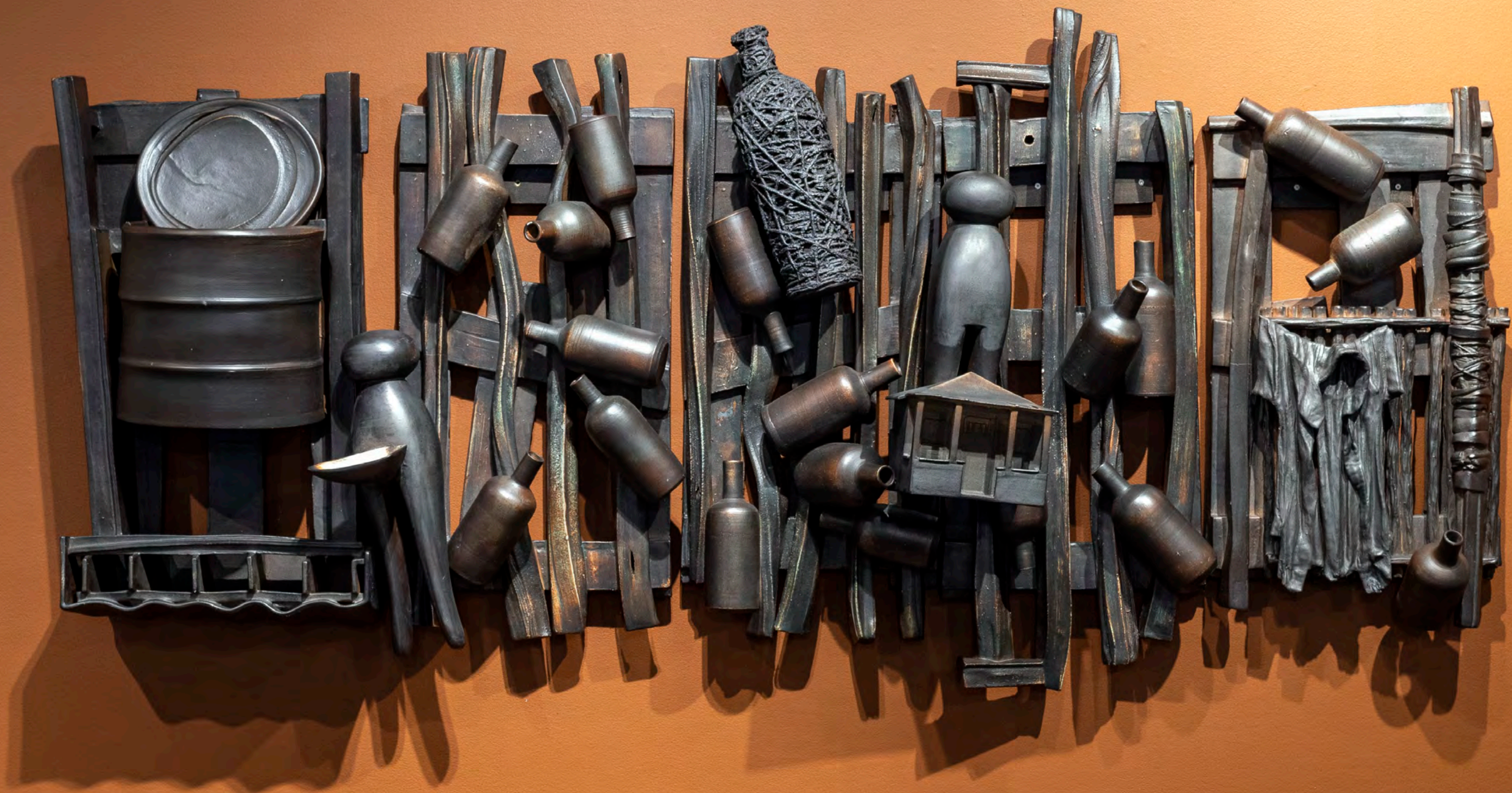
Ramshackle Fence , 2008-2012 Earthenware, graphite, acrylic, 30 x 75 x 9 inches