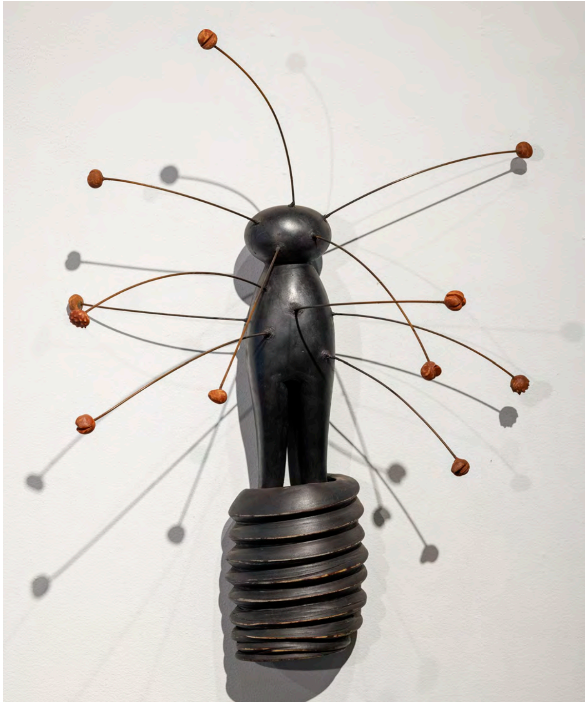
Mother Pin with Seeds Clay, graphite, 31 x 22 x 12 inches