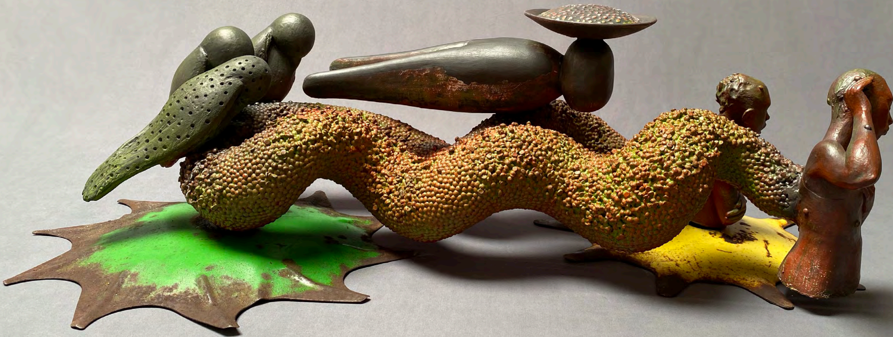
Mother Pin Transitions , 2021

Clay, graphite, water color, rototiller blades, 14 x 48 x 22 inches