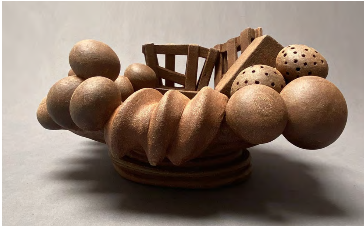
Farm Bowl with Orchard , 2021 Stoneware, 9.5 x 18 x 21.5 inches