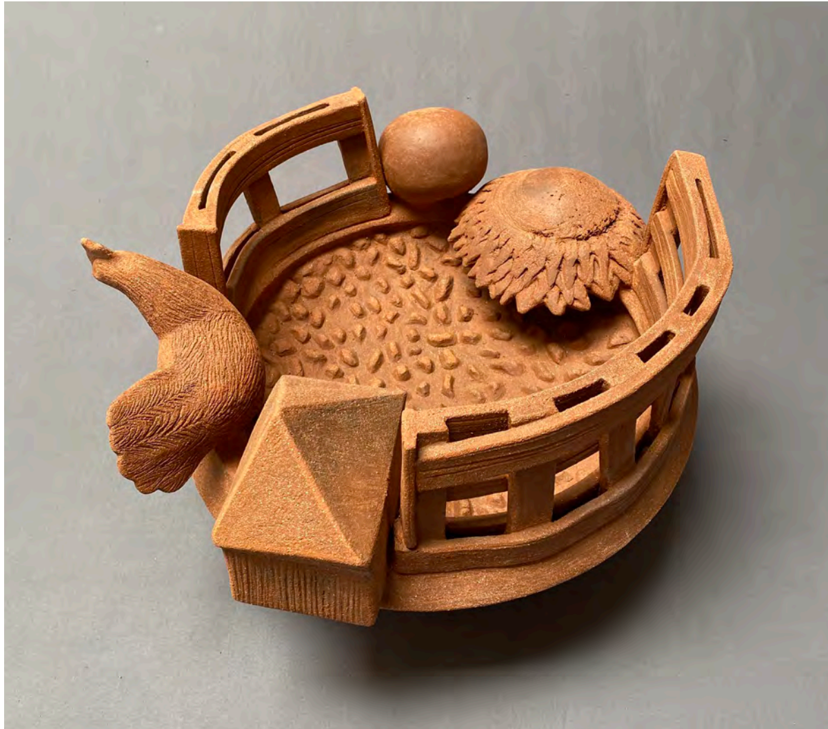
Farm Bowl with Chicken, 2021 Stoneware, 11 x 18 x 21 inches